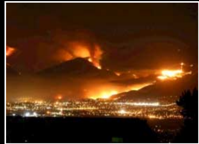
Southern California Wild Fires