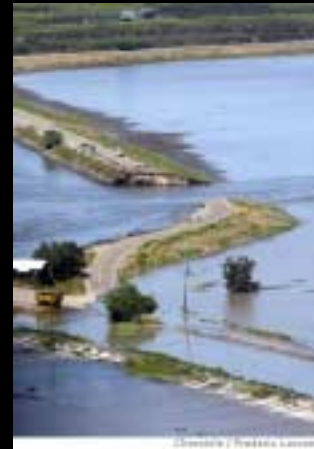
Levee in Stockton