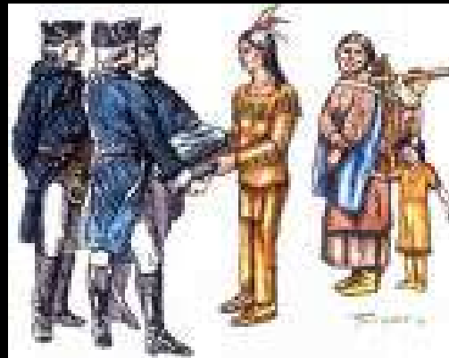
Illustration: Lord Jeffrey Amherst giving smallpox blankets to Native Americans