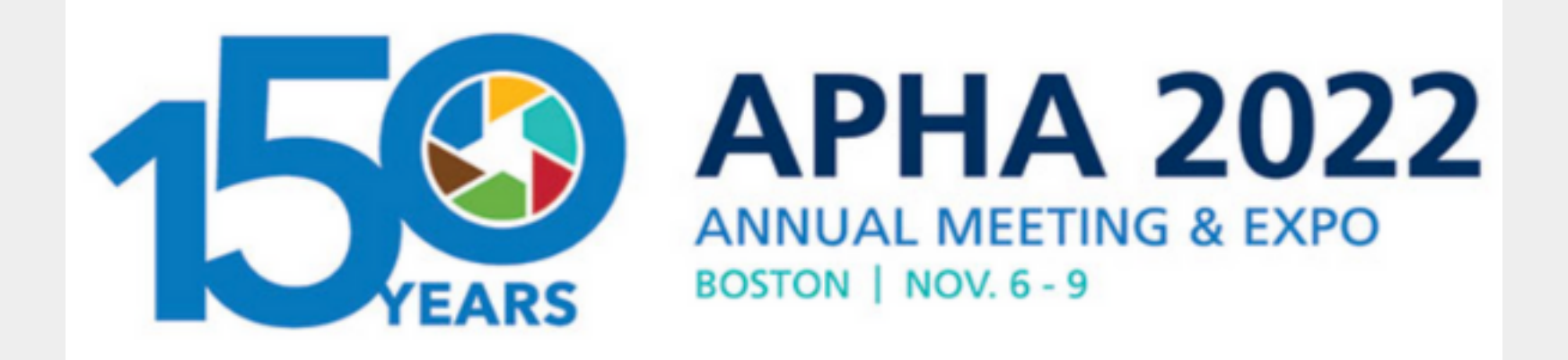
To submit an abstract, click above